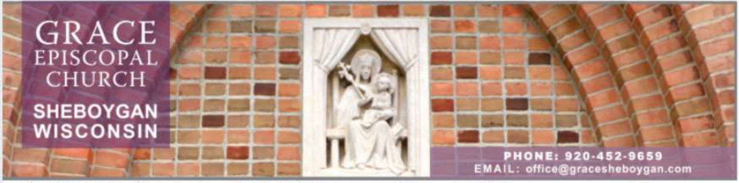
1011 N. 7th St. (Ontario Ave. & 7th St.) Sheboygan, Wisconsin 53081 + www.gracesheboygan.com