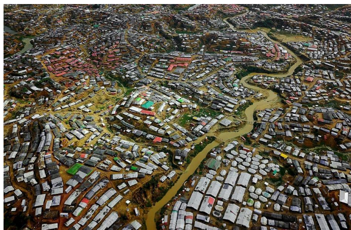
Kutupalong Camp - 920,000+ Refugees

These five families have fled many dangers and are now on a path towards thriving rather than just surviving. Since January, the Guild of Saint Alban has made themselves available to transport one of the families to doctor and dentist appointments, to the DMV, to school, to the laundromat, to the bank, to the grocery store, and many other places so that they may begin to learn how to live well in Sheboygan. As you can