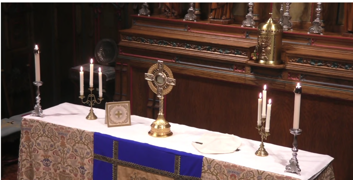
(Service of Benediction during the Walsingham Pilgrimage of October 2020)